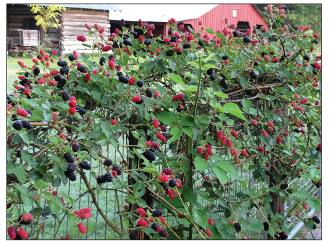
Blackberries can be very productive in East Texas.

Recommended blackberry cultivars for Texas include